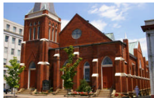
First Baptist Church, Raleigh, will host 2010 Congress of Christian Education One Day Session on March 27.

The Congress offers training in Christian education with concentrations in Ministerial Development, Leadership Development, The Sunday School and Vacation Bible School, Evangelism and Missions, Teacher Training and Development, Youth Ministry, Biblical and General Studies, Music Ministry and the Arts, and The Youth Division.