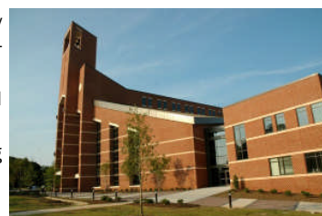
Friendship Missionary Baptist Church is the host Church for the 2010 Congress of Christian Education One Day Session on Saturday, February 13, 2010.